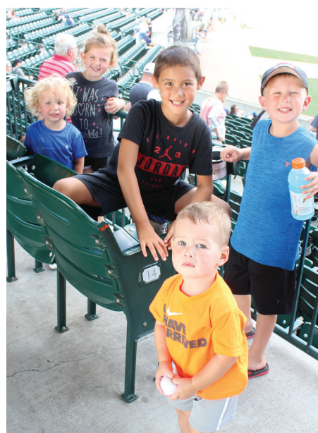
Kids out to the ballpark visiting with Saltdogs mascot Homer.