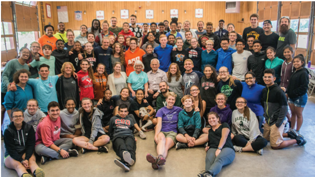
Photo: YLC's 2018 Congregation of Future-focused Leaders of our Deaf America

My recently-published 545-page book, "From Oaks to Acorns: Promoting Deaf Youth Leadership Through Multigenerational Engagement," features two informative chapters about the YLC program and costs $39.95, plus postage and handling.