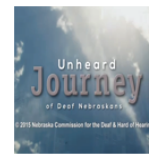
Unheard Journey of Deaf Nebraskans NET Connects